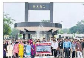
ఎన్ఎఆర్ఎల్ వద్ద మిట్స్ విద్యార్థులు

కురవలకోట: అంగళ్లలోని మిట్స్ డీప్స్ యూనివర్సిటీ విద్యార్థులు తిరుపతి జిల్లాలోని గాదంకి వద్ద ఉన్న ఎన్ఎఆర్ఎల్ను పరిశ్రమల సందర్శనలో భాగంగా సందర్శించారు. ఈ సందర్శన విద్యార్థులకు పరిశోధన, ఆవిష్కరణ, సైన్స్ టెక్నాలజీ రంగంలో భవిష్యత్ కేరీర్కు ప్రేరణ కల్పించినదని తెలిపారు. వాతావరణ శాస్త్రాలు, ఉపగ్రహ వ్యూహానికేషన్, వాతావరణ అంచనా, అంతరిక్ష సాంకేతిక అనువర్తనాల్లో అత్యున్నత పరిశోధనలపై విలువైన అందర్నెవ్వరినూ తెలుసుకున్నట్లు విద్యార్థులు వెల్లడించారు.